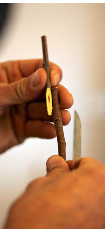
Above: A close-up of the grafting process