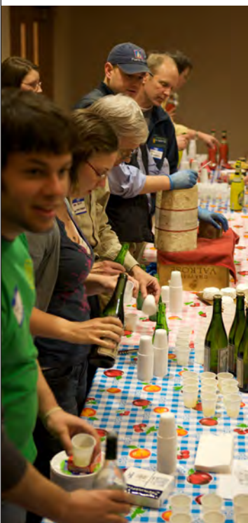
Above: A cider and cheese tasting in Madison, WI

These are not the only trends favoring a renaissance for heirloom apples in many regions of North America. Interest in organic, artisanal, hand-crafted and place-based heritage foods has never been higher. Sales of organic fruits, for example, have been growing by an estimated 12 percent per year! Heirloom apple growers can build on these interests. Chefs are willing to help them match the right apple with a specific use for which it is unsurpassed. For years, orchard keepers of diverse apples didn't get much respect. Perhaps their time has come again.