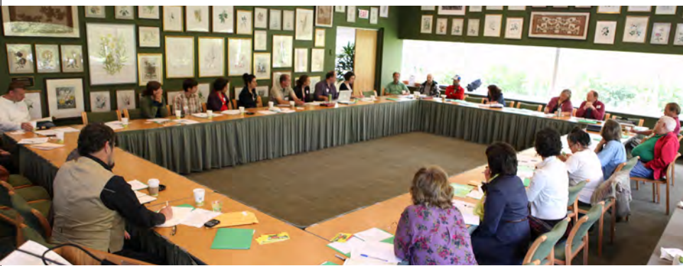
Top left and right: RAFT Alliance workshop on restoring forgotten fruit